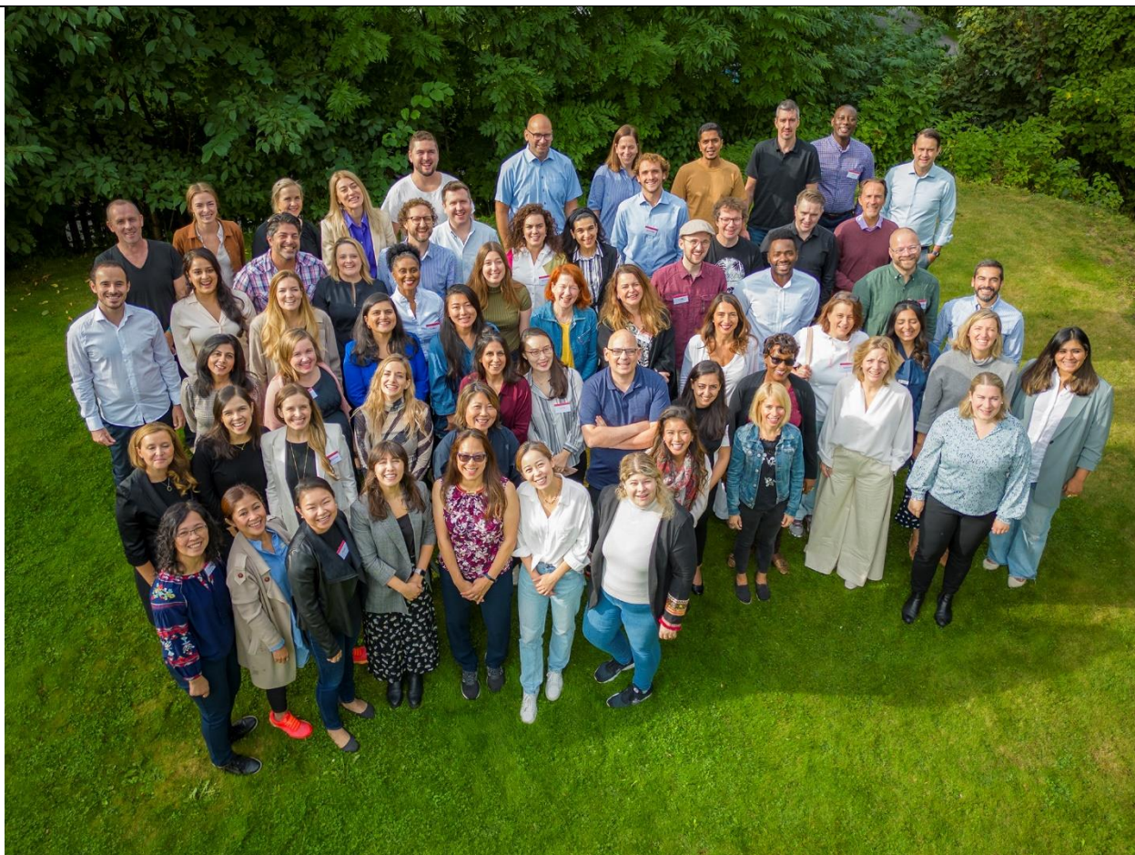
Office of Innovation Team